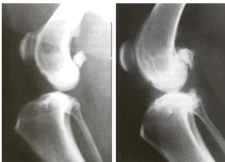
Fig 2 nearly normal joint